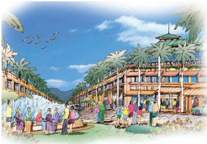
The village center is the “heart” of the Koa Ridge community.

become Koa Ridge Makai’s central hub for business, retail and entertainment.