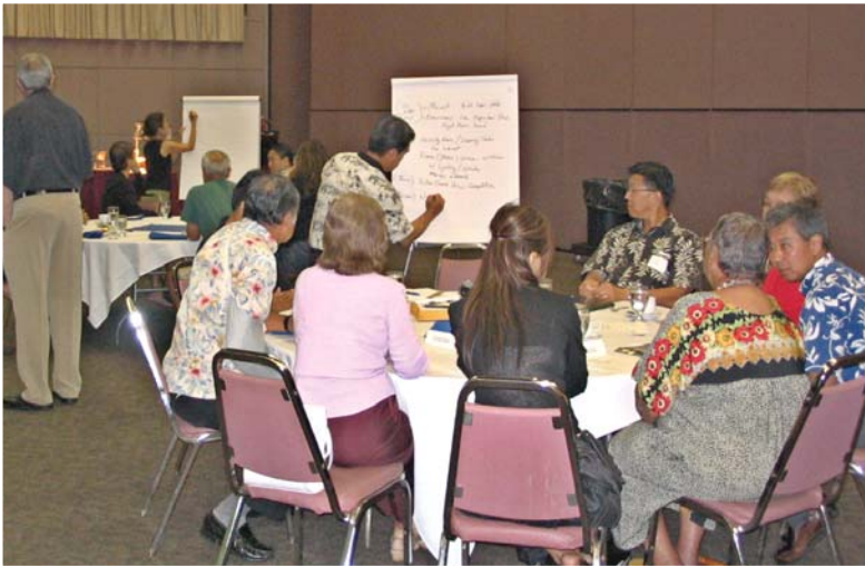
Ideas for the Village Center keep flowing